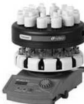
Fig. 2: Carousel Reaction Station