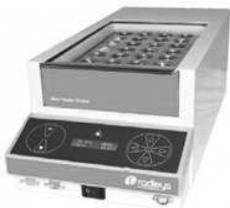
Fig. 3: Metz Heater Shaker