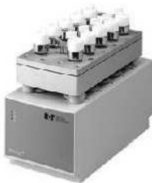
Fig. 4: Metz Syn 10 Reaction Station