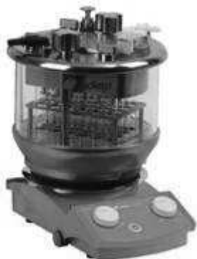
Fig. 1: GreenHouse Parallel Synthesiser